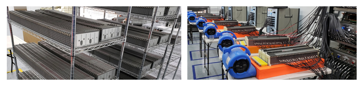
Reconditioning Facility in NYC 240 channels = 240 modules processed per day.

The NuVant mission is to "Bring electrochemistry to the streets." Everyone can learn to use NuVant battery refurbishing equipment. Do not worry if you know nothing about batteries. Many shops using the EVc-12 had no prior knowledge.