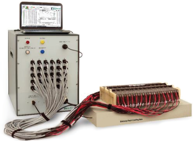
EVC-30 battery reconditioning unit connected in parallel to a 28-module Prius pack. One parallel connection does the job.

A full-time EVC-30 is fully paid off in 2 1/2 months!